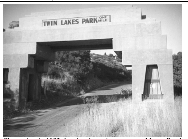
Photo taken in 1935 showing the main entrance at Mayan Road and Santa Susana Pass Road. Although the arch was removed at some point in time, the entrance road existed until Topanga Canyon was extended to the 118 Freeway in 1975. The remains of Mayan Road can still be seen on the east side of Topanga. Today you reach Mayan Road by turning right on Poema just past the Freeway entrance from Topanga.

Twin Lakes is an unincorporated community of homes northeast of the 118 and Topanga Canyon Blvd. The community was created in the 1920's as a rural resort, and promoted as a retreat for the weekend, season or holiday. Similar developments, which were in vogue during the roaring 20's, were Gerard at Ventura Blvd and Topanga (middle-eastern theme), and Rustic Canyon in Santa Monica (Will Rogers and Polo fields). Twin Lakes had an Aztec-Mayan theme.