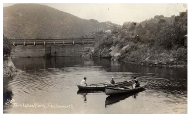
Twin Lake residents boating on Raymond Lake. The Dam shown on the left is still in place and serves as an access bridge to homes north of Devil Canyon. The dam gate was opened in April of 1948 after much discussion of required maintenance and with some hesitation, not knowing if it would refill with the next rain season. Their newsletter account of the situation says "the canyon foamed water for 40 minutes....then a million gallons

as Raymond Lake) has been dry since 1948. The lake at Browns Canyon dam was silted over in the 40's, but can still be seen today if you drive to the end of DeSoto just north of the freeway, and look up the canyon. Raymond Lake was the centerpiece of the community with the adjacent boat landing, swimming house and Mayan Observation Building. Local Chatsworth residents are known to have been baptized at Raymond Lake.