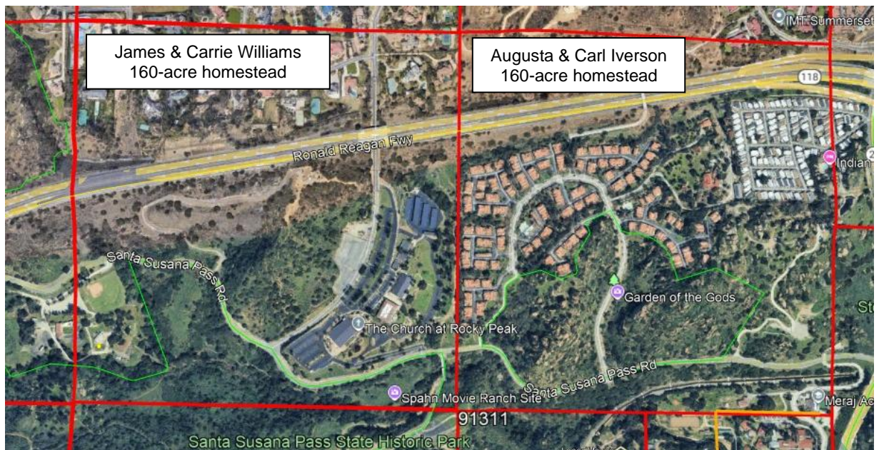
Google Earth overlay of the Williams and Iverson Homesteads