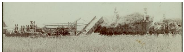
A mowing machine, also called a "header". The horizontal blades gather the cut grain, and it is loaded onto a wagon traveling next to the team via a conveyor belt. 1964-12

2-minute movie of steam engine threshing