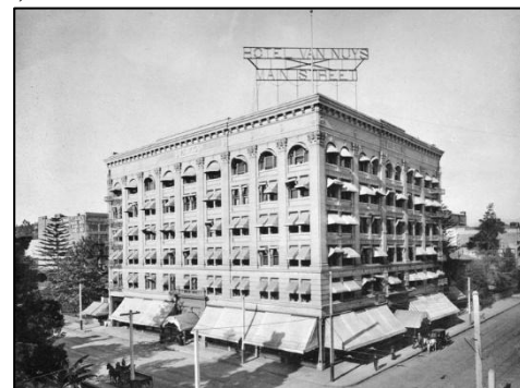
1897 Van Nuys Hotel, N/W corner of Main and 4th Streets.