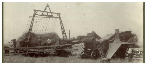
A wagon is unloaded using a huge net, and grain is pitchforked to a conveyor belt on a steam driven thresher and separator. Steam engine is out of picture at left, turning the conveyor belt in foreground. Sacks filled with grain are stacked at far right. Williams photo 1964-17