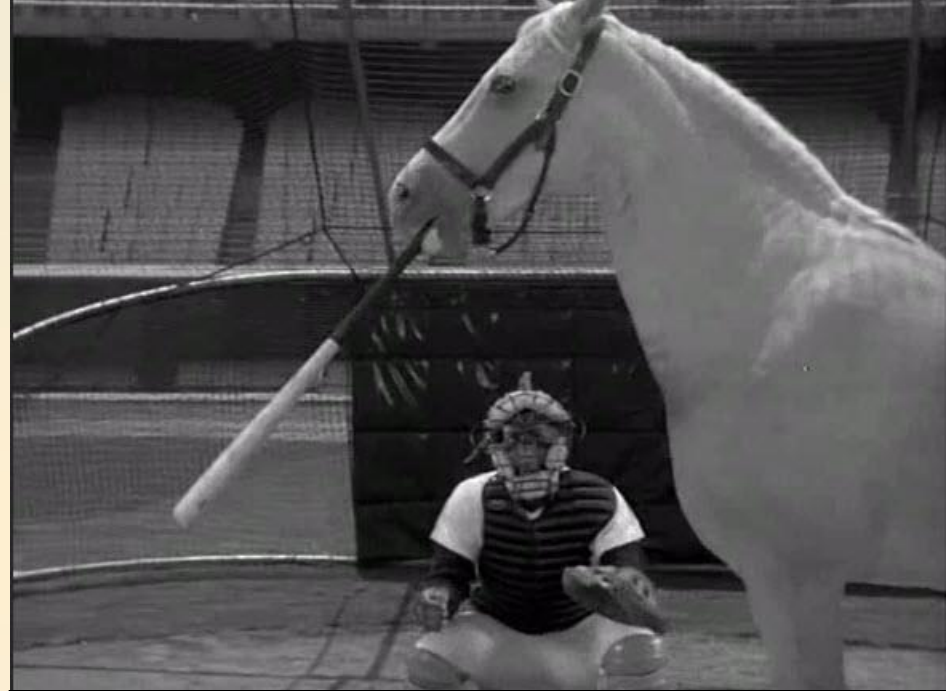
A Scene from 1963, Leo Durocher meets Mr. Ed