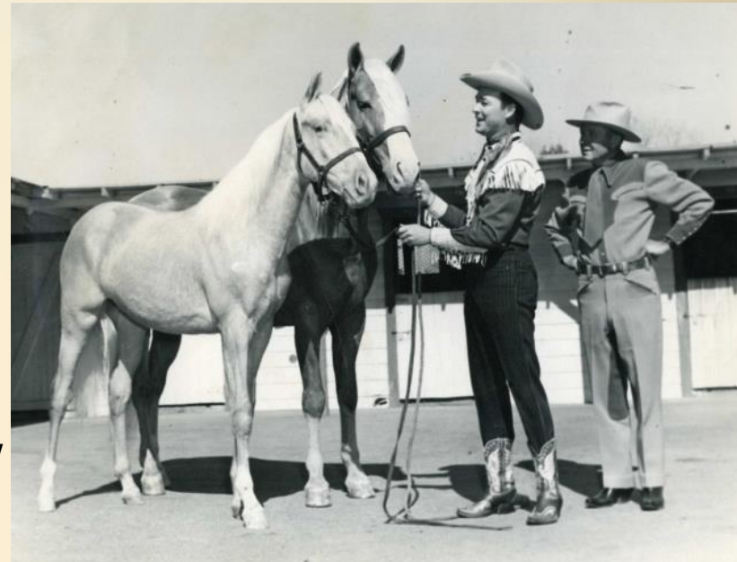
Trigger and Trigger Jr. were registered with the Palomino Horse Association