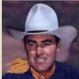
Allan "Rocky" Lane 1904-1973