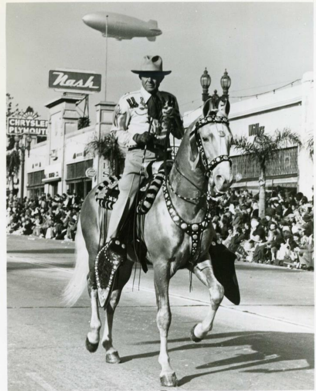
THE HARVESTER 2359-14 P.H.A.