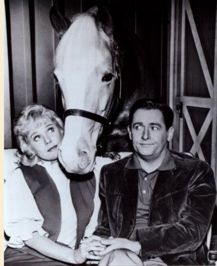
Connie Hines, Bamboo Harvester, Alan Young