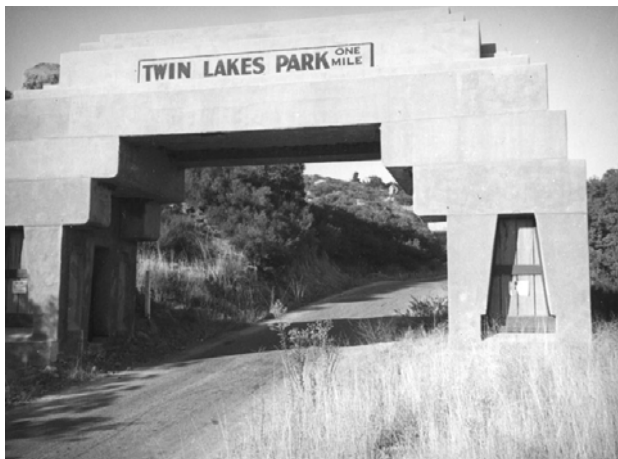
Photo taken in 1935 showing the main entrance at Mayan Road and Santa Susana Pass Road. Although the arch was removed at some point in time, the entrance road existed until Topanga Canyon was extended to the 118 Freeway in 1975. The remains of Mayan Road can still be seen on the east side of Topanga. Today you reach Mayan Road by turning right on Poema just past the Freeway entrance from Topanga.

Twin Lakes is an unincorporated community of homes northeast of the 118 and Topanga Canyon Blvd. The community was created in the 1920's as a rural resort, and promoted as a retreat for the weekend, season or holiday. Similar developments, which were in vogue during the roaring 20's, were Gerard at Ventura Blvd and Topanga (middle-eastern theme), and Rustic Canyon in Santa Monica (Will Rogers and Polo fields). Twin Lakes had an Aztec-Mayan theme.