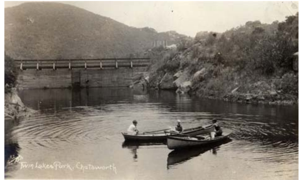
Twin Lake residents boating on Raymond Lake. The Dam shown on the left is still in place and serves as an access bridge to homes north of Devil Canyon. The dam gate was opened in April of 1948 after much discussion of required maintenance and with some hesitation, not knowing if it would refill with the next rain season.

as Raymond Lake) has been dry since 1948. The lake at Browns Canyon dam was silted over in the 40's, but can still be seen today if you drive to the end of DeSoto just north of the freeway, and look up the canyon. Raymond Lake was the centerpiece of the community with the adjacent boat landing, swimming house and Mayan Observation Building. Local Chatsworth residents are known to have been baptized at Raymond Lake.